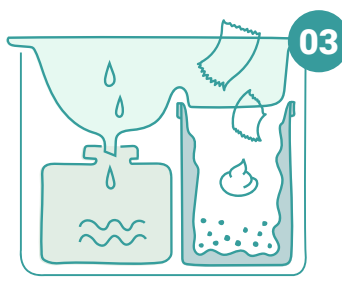
Liquids in front, solids & toilet paper in the back, dispose of hygiene products separately