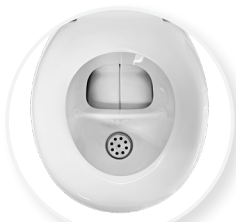
Convenient Chamber Screen